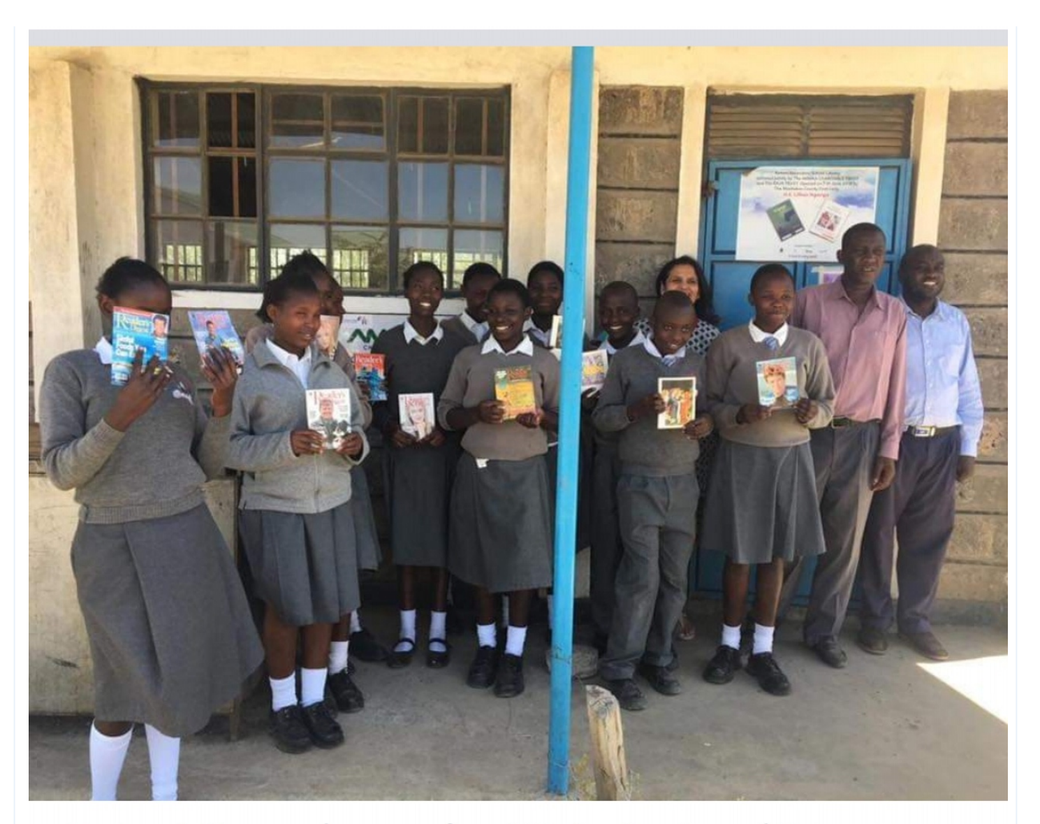
Katani Secondary school Principal and Deputy Head receiving the books.