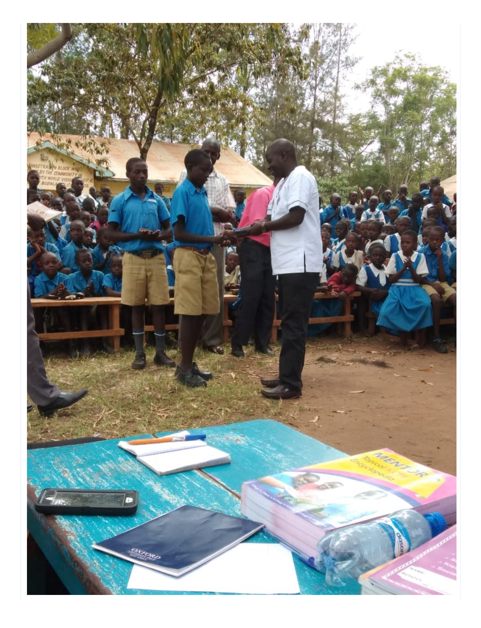
Page 4 of 13 Shishukunj United Kingdom www.books2africa.org