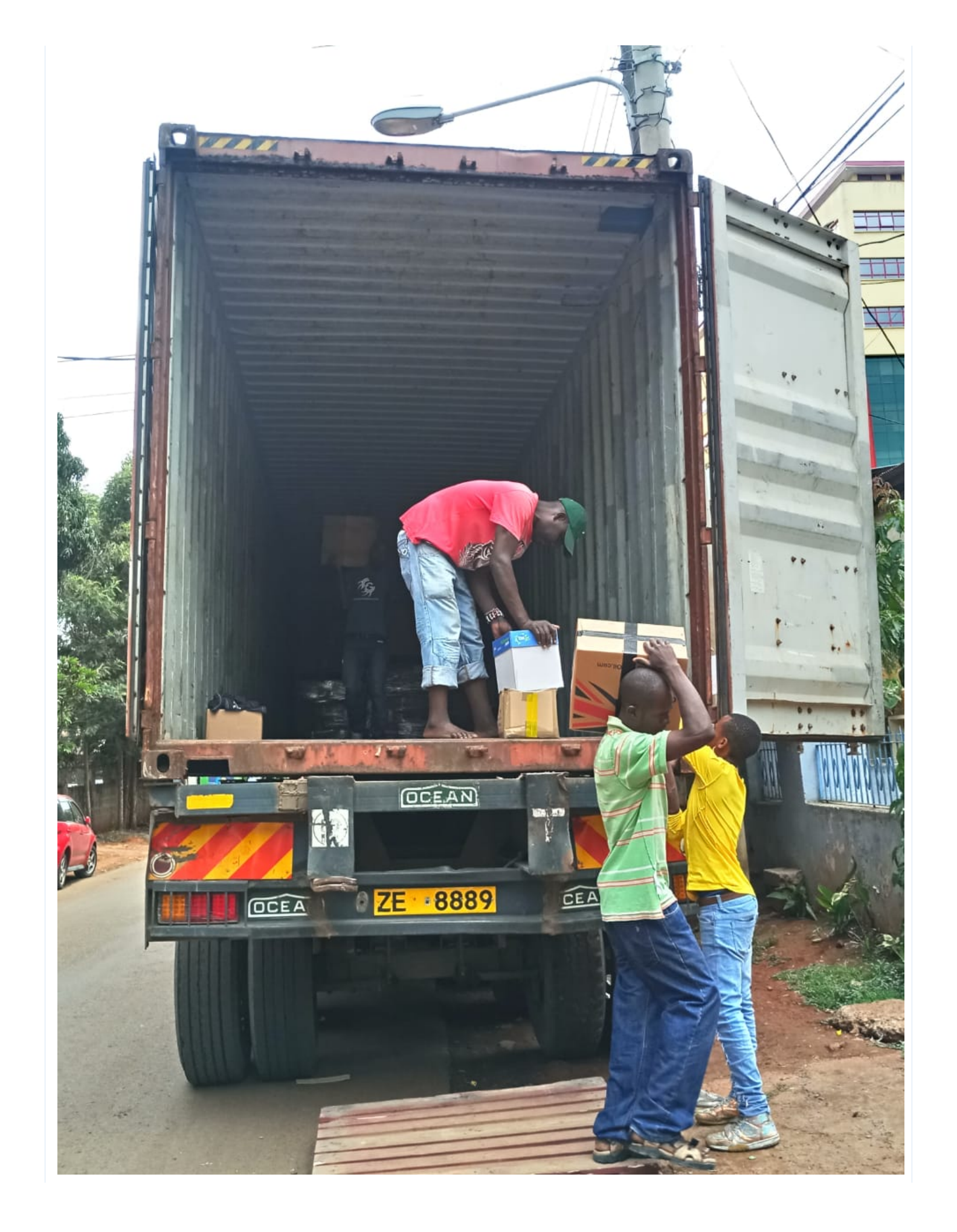
Page 10 of 13 Shishukunj United Kingdom www.books2africa.org